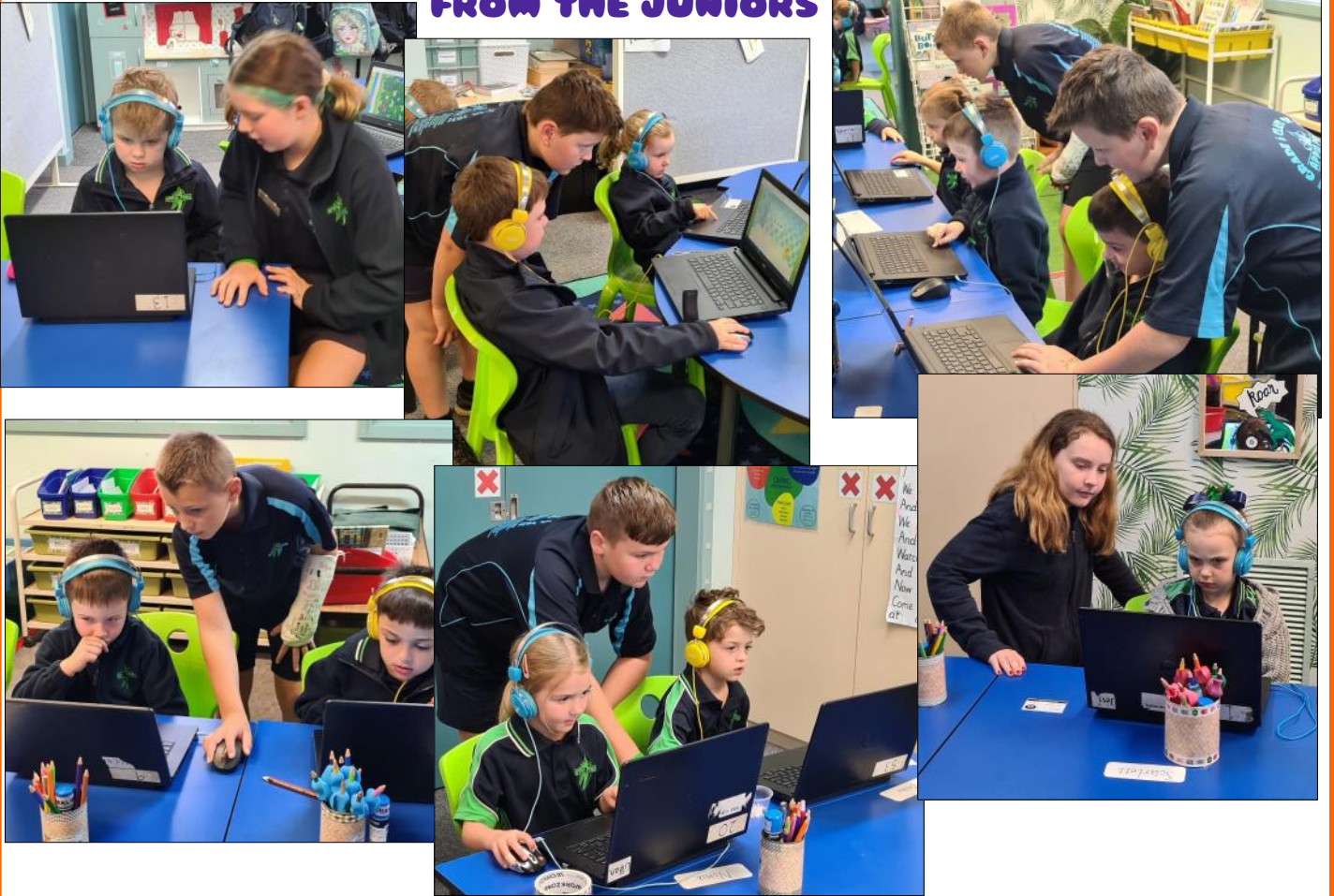
Some Grade 6 helpers were on hand when the Foundation class used the laptops!