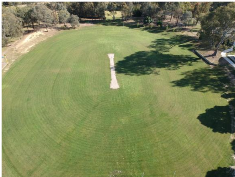
Big Shout out to Peter Thrum who has been maintaining our school yard and in particular making our oval look amazing at the moment.