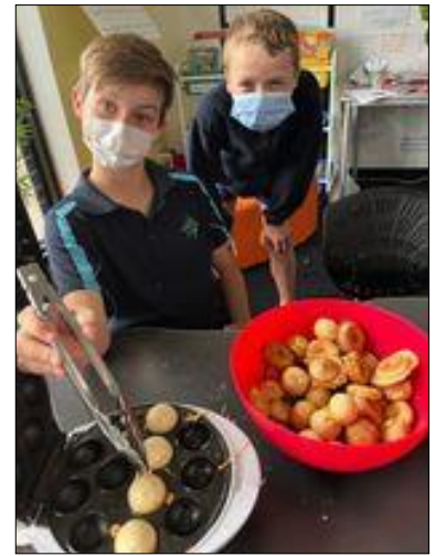
5/6 students enjoyed cooking on National Donut Day while practising their procedural writing.