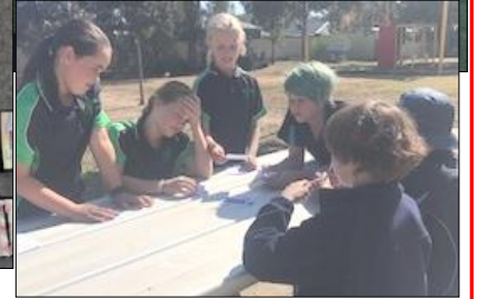
Maths in the sunshine.