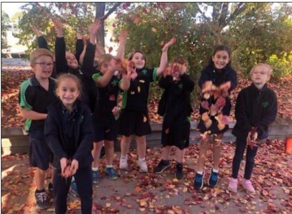
Playing in the Autumn sunshine!