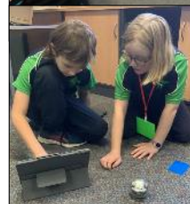
Coding Spheros in Digi Tech