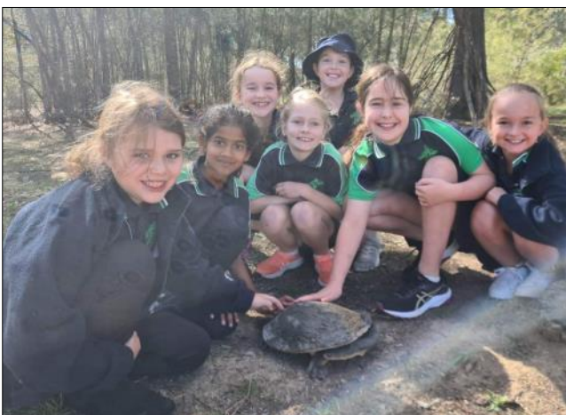
We had a visitor in the yard at recess today!