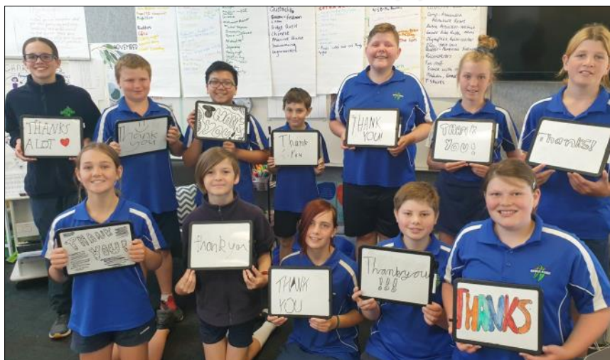
Thanks APPA for our new set of whiteboards!