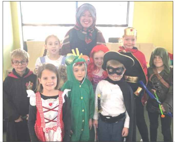
Assembly was full of colour and excitement this week as our P-2s enjoyed a Book Week dress up and parade. Some colourful and well thought out costumes came out as we celebrated all that is great about books and reading.

Enjoy the rest of the week and the weekend!