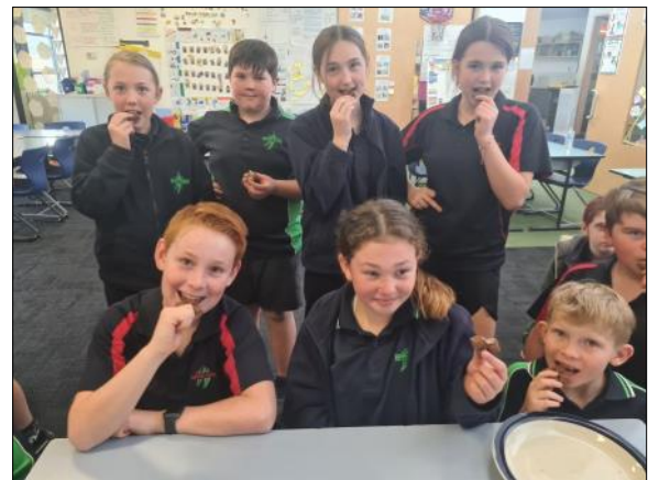
Mmmmm Maths. Here we are learning about fractions through the use of chocolate!!!