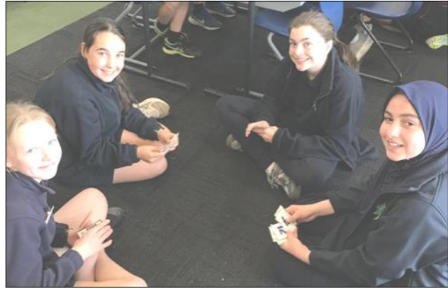
We have been learning about fractions through a variety of games. Here 5/6G are playing a fraction card game called Donkey!