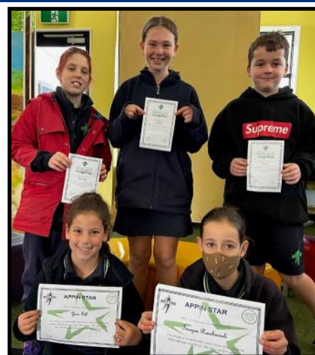
This week's award recipients.