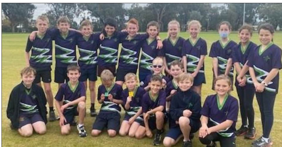
Well done to all our district cross country participants!